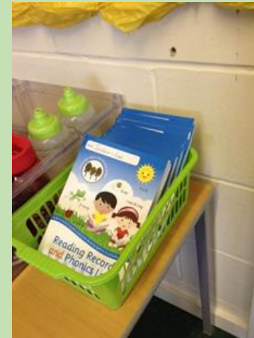
Reading Book and Reading record